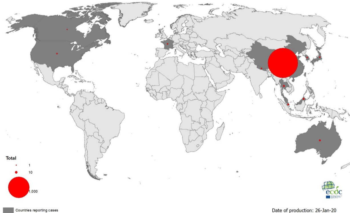
Figure 2. Distribution of laboratory confirmed cases (n= 2 026) of 2019-nCoV, as of 26 January 2020 – 09.00 GMT[7], by date of reporting.